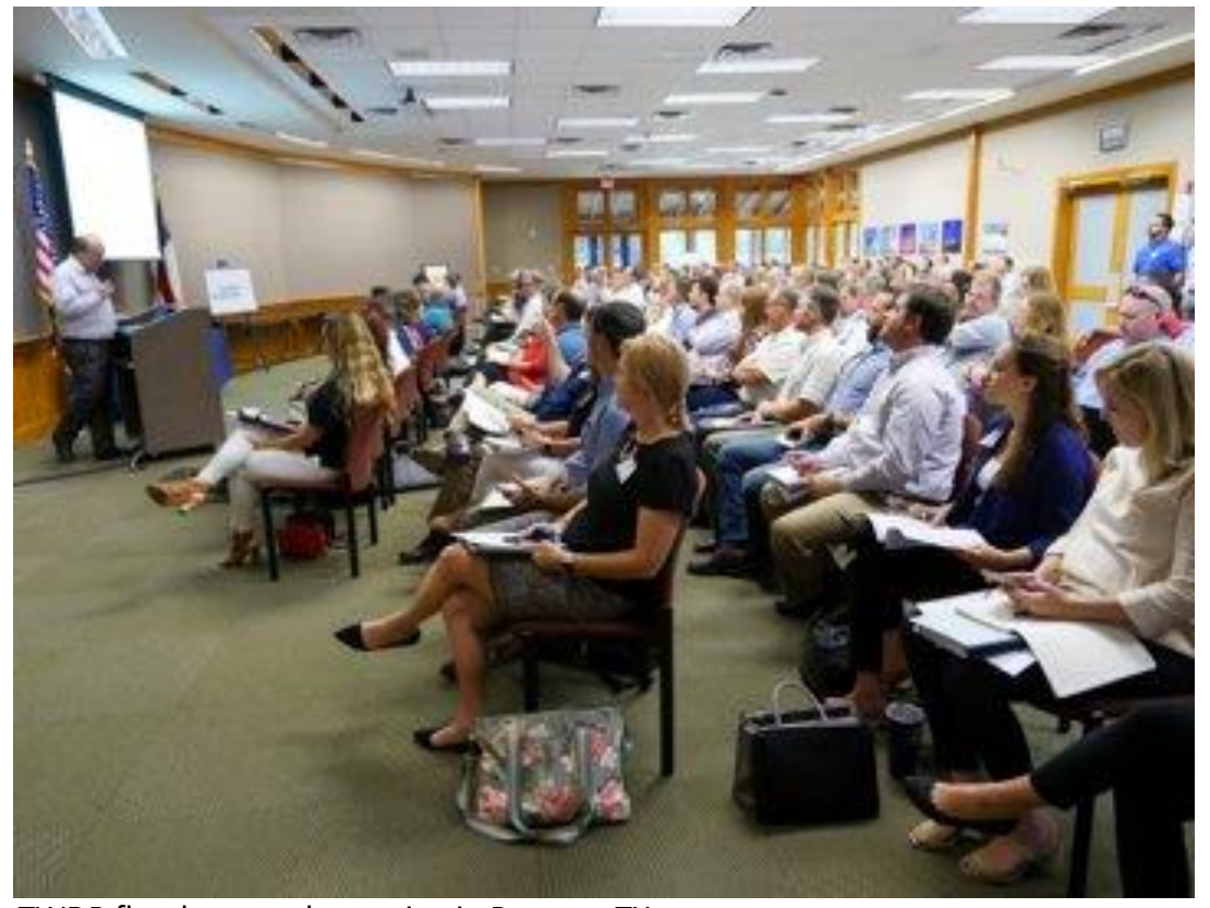
TWDB flood outreach meeting in Bastrop, TX.