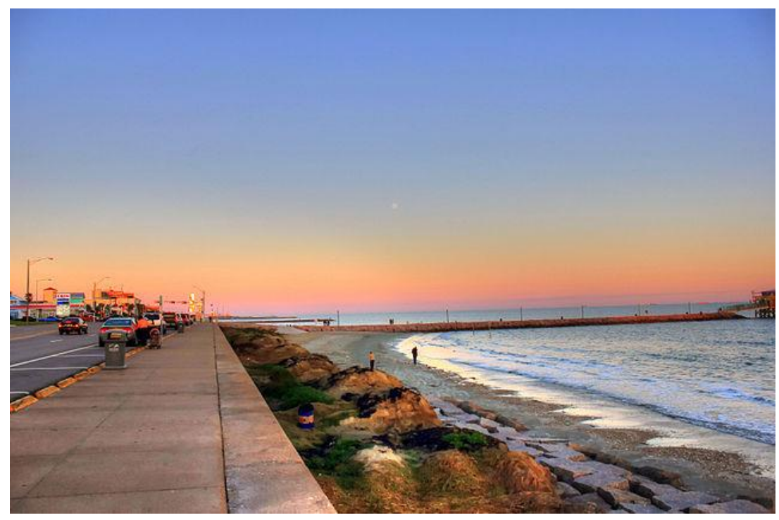
Galveston Seawall, a structural flood mitigation solution.