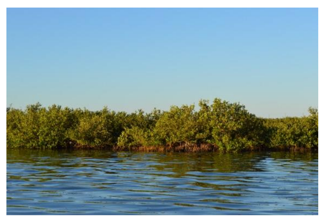
Mangroves on the Texas Coast stabilize shorelines and help absorb storm surge; an example of a non-structural flood mitigation solution.

The implementation of actions, including both structural and non-structural solutions , to reduce flood risk to protect against the loss of life and property.