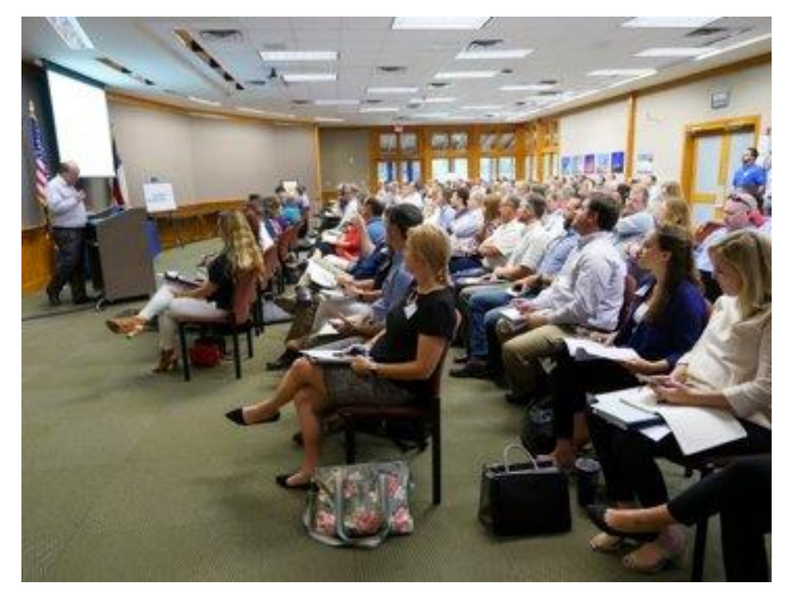
TWDB flood outreach meeting in Bastrop, TX.